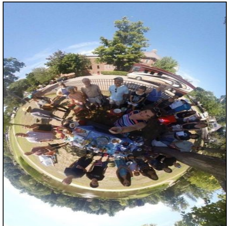
This is a 360 Tiny Planet photo taken by Sarah with a 360 ONE camera of the vegan group at White Park.